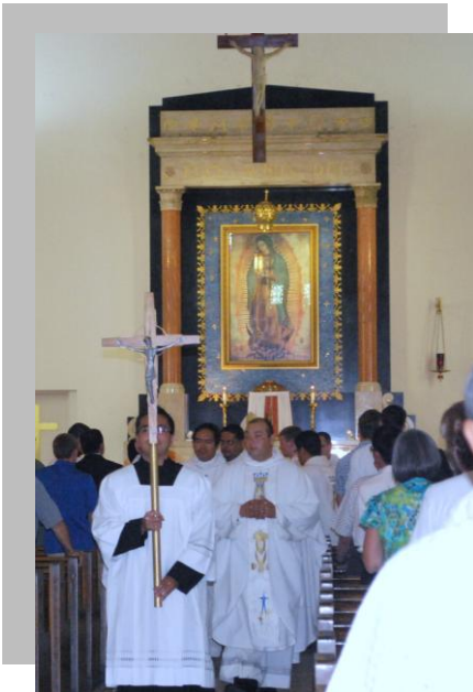
Saint Francis Xavier Parish Mass, August 4, 2011. Dinner Seminarians & Serrans.